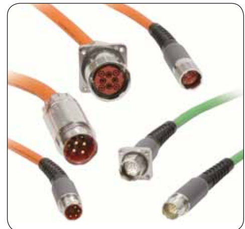
Cables are available for MP-Series Motors and other Allen-Bradley motors and actuators with DIN style connectors.